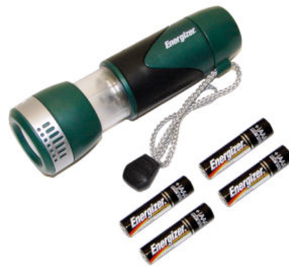
L Energizer 2 in 1 LED flashlight, 4 X AAA batteries $22 http://www.servicelighting.com