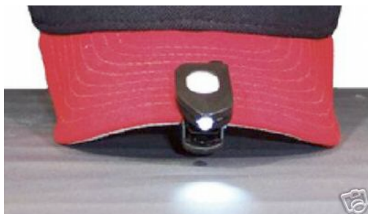
G Clip LED flashlight, coin battery $5 http://www.glowbug.com