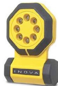
H Inova 24/7 LED flashlight, 1 x CR123 battery $50 http://www.amazon.com