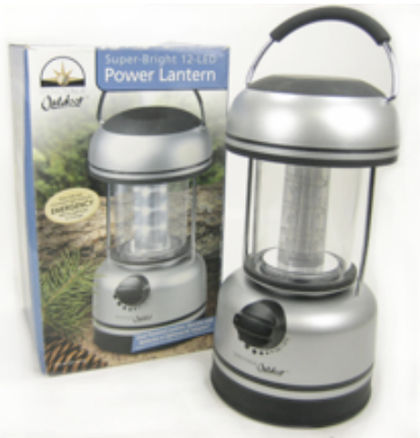
I Emerson 12 LED lantern, 4 X D batteries $40 http://www.amazon.com