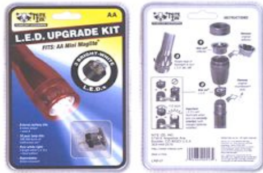
B Conversion kit for AA cell Maglites. 100,000 hr bulb life ~$10 for kit ~$20 for new lite http://www.maglite.com