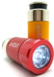
C Cigarette lighter LED flashlight, built-in batteries $20 http://www.sportsimportsltd.com