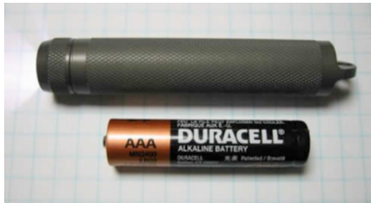
E ARC-AAA LED flashlight $30 http://www.arcflashlight.com/