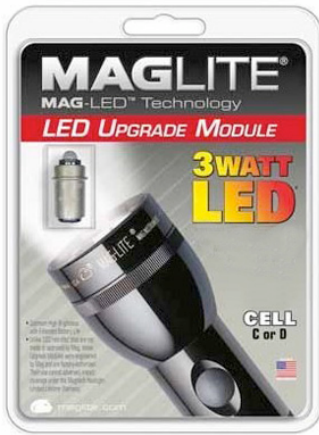
A Conversion kit for C & D cell Maglites. Roughly 2X the light for 20+ hours $25 http://www.maglite.com