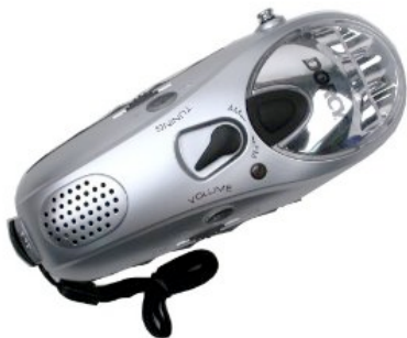
M Dorcy 3 LED Dynamo Flashlight + Radio, no batteries needed $40 http://www.amazon.com