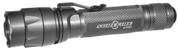
F Surefire L4 Lumamax LED flashlight, 2 x CR123 batteries $175 http://www.surefire.com