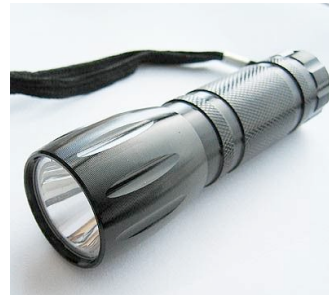
D 9-LED flashlight, imported. $10 and less at any discount store (Target 2 for $10)