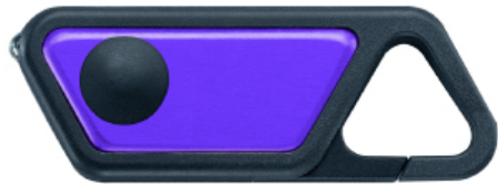
K ASP LED flashlight, coin battery $12 http://www.tacticalflashlights.com